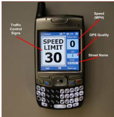
Figure 2.2 Palm Treo TDSS interface.

A small pilot study was conducted with 16 teen drivers aged 18 and 19 years old. Eighty percent found the system improved their driving safety and a small reduction in speed was observed when using the system as compared to when the system was inactive.