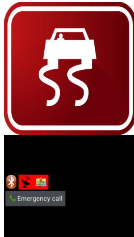
Figure 2.6 Excessive maneuver visual warning.