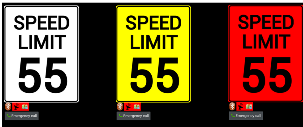
Figure 2.4 Progression of visual speed warnings.

Based on speed limit data available in the digital maps, the system could detect speeding events. The system would display a yellow speed limit sign alert if their speed exceeded the speed limit by at least 2.5 mph to notify the driver their speed is increasing. If their speed exceeded the speed limit by at least 7 mph, the system would display a red speed limit sign warning and play an auditory warning. If they continued driving at least 7 mph over the speed limit the system would send a text message to their parent and the violation would be logged. The progression of visual speed warnings is shown in Figure 2.4.