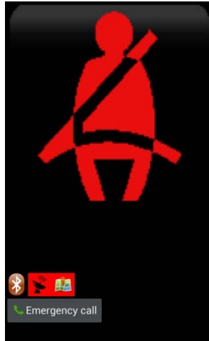
Figure 2.3 Seatbelt visual warning.

The ArDAQ also detected the number of passengers in the vehicle via detection plates mounted in the vehicle's footwells. Due to GDL, which restrict the number of passengers a teen driver may have, the system would log the number of passengers for drives. This data was included in weekly report emails and logged on the website but was not presented in real-time or texted to parents due to inconsistent sensor performance.