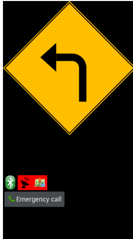
Figure 2.5 Advanced curve visual notification.

The system also used the digital maps to provide advanced warning of curves and speed limit changes. When a speed limit change was detected, the system would play an auditory message warning the driver of the change in advance. Similarly, when the map contained information about an upcoming curve, it would show a visual warning notifying the driver. The advanced curve notification is shown in Figure 2.5.