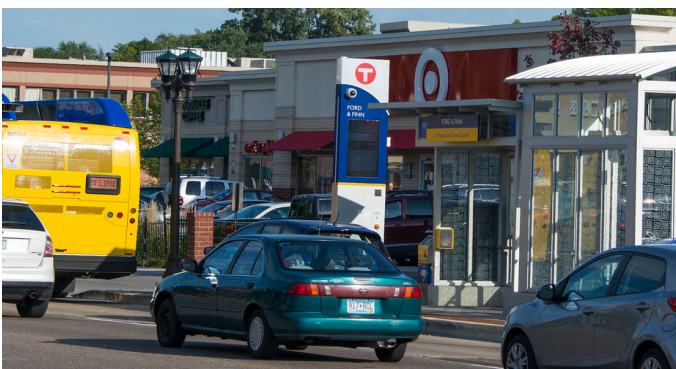
A Line bus rapid transit in St. Paul

While the team found no significant impacts on employment by single-location firms or sales by multiple-location firms, Wexler says, there was “strong evidence that, on average, the Green Line reduced sales for single-location firms.” Estimates of sales-volume reductions for these firms ranged between 10 to 20 percent depending on model specification, aggregation level, and distance threshold from the line. Importantly, these effects were primarily felt after construction ended. “In fact, the sales declines only became significant after the Green Line opened,” Wexler says. “Residential construction near some of the stations continued business disruptions.”