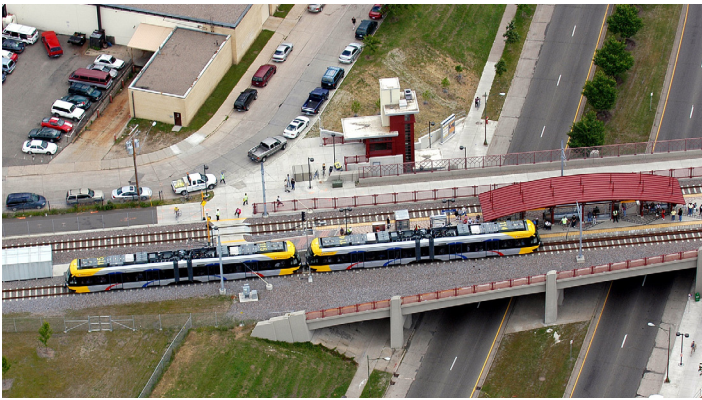
Blue Line in Minneapolis (Franklin Avenue Station)

their size. “One explanation is that the Blue Line did not disrupt physical infrastructure to the extent the other lines did,” Wexler says.